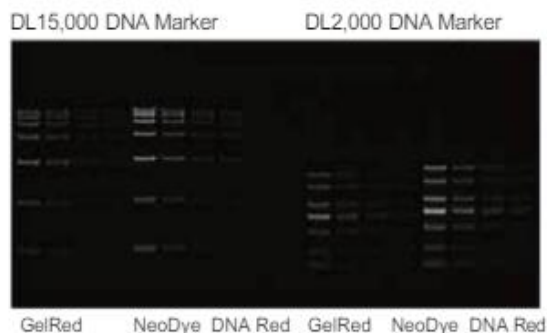
Fig 1. The results of NeoDye DNA Red and standard GelRed nucleic acid gel staining

Fig 1. and Fig 2. are NeoDye DNA Red dye nucleic acid electrophoresis and cell membrane permeability assay (cytotoxicity assay), respectively.