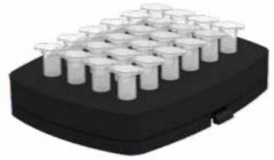
Micro Centrifuge Tubes