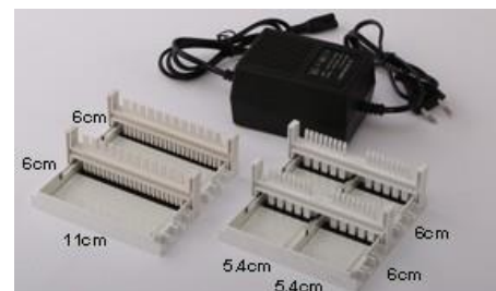
Accessories included with NB-12-0020B